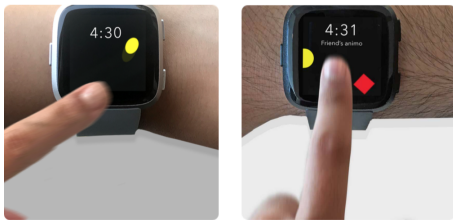
Figure 1: Example Animo smartwatch application usage, for sending and receiving heart rate-driven "mood" animations.

My research has demonstrated the potential for physiological data to empower more intimate and meaningful expression and communication between remote users. In a two-week field study with 13 participants, I deployed a mobile application system that prompted users to text their heart rate to their close contacts [8]. In a second field study with 17 dyads, I deployed Animo, a "mood-sharing" smartwatch application that represents mood through a shape that animates and changes color according to a user's heart rate (see Figure 1). In both of these studies, I collected and analyzed qualitative data through questionnaires and interviews about participants' experiences using the systems in their daily lives.